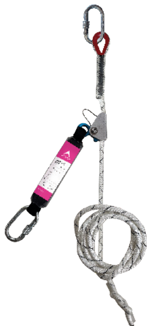
LS 3 lifeline